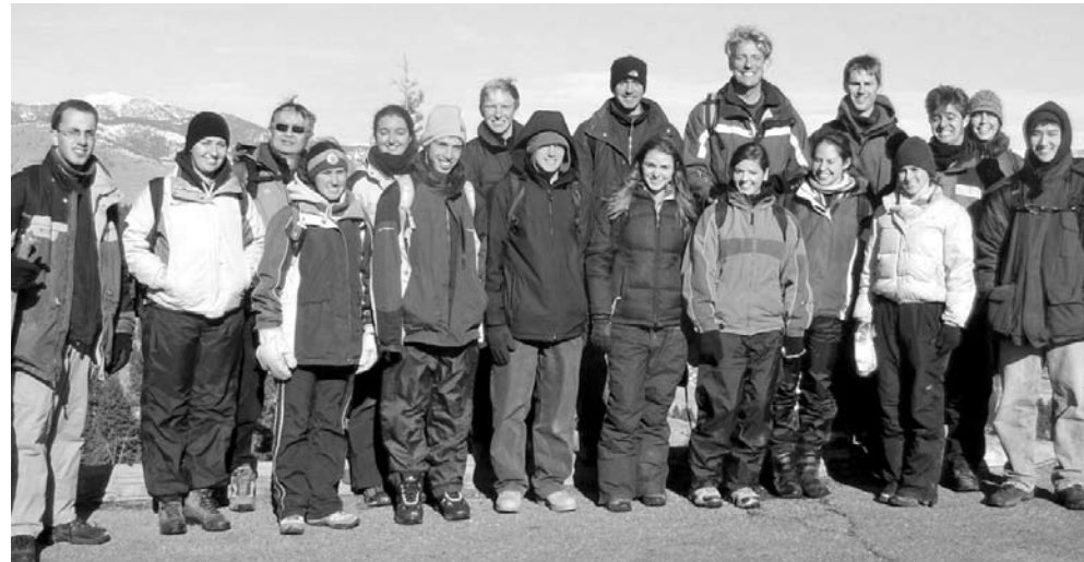
Chancellor's Scholars at Yellowstone National Park