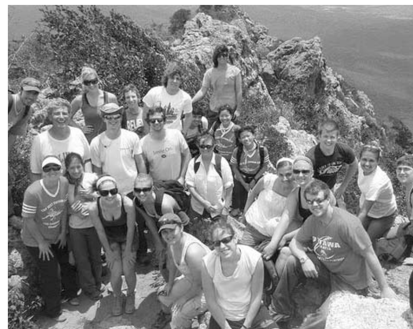
Chancellor's Scholars taking a break from scuba diving